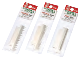
138691B-C Coarse Blade (10) 138691B-M Medium Blade (10) 138691B-F Fine Blade (10)