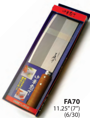
FA70 11.25" (7") (6/30)