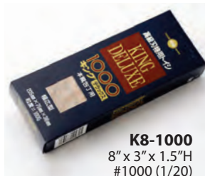
K8-1000 8" x 3" x 1.5"H #1000 (1/20)