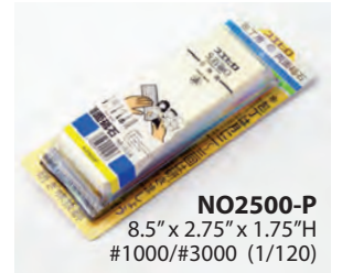
NO2500-P 8.5" x 2.75" x 1.75"H #1000/#3000 (1/120)