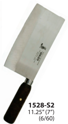
1528-S2 11.25" (7") (6/60)