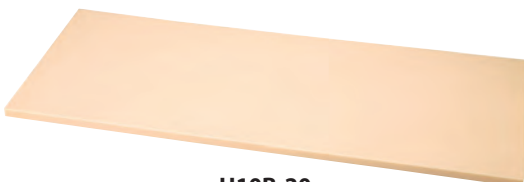
H10B-20 1000 x 400 x 20mm (1/3)