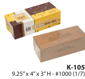
K-105 9.25" x 4" x 3"H - #1000 (1/7)