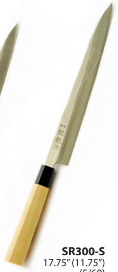
SR300-S 17.75" (11.75") (5/60)