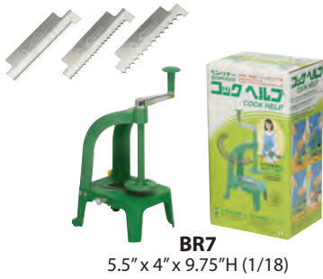
BR7 5.5" x 4" x 9.75"H (1/18)