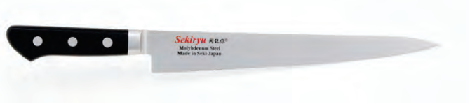
SR-MS240 14.5" (9.75") (1/24) Molybdenum Steel