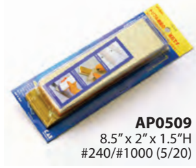
AP0509 8.5" x 2" x 1.5"H #240/#1000 (5/20)