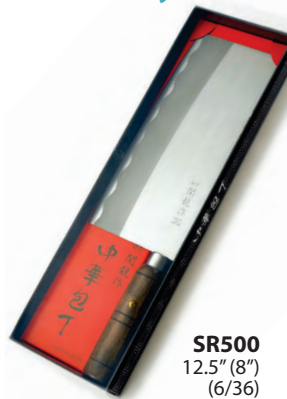
SR500 12.5" (8") (6/36)