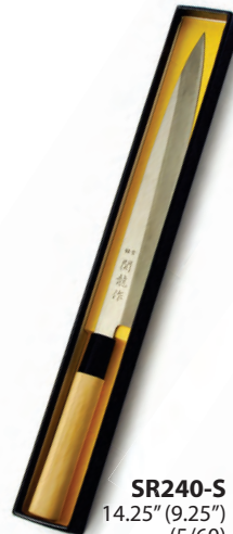
SR240-S 14.25" (9.25") (5/60)