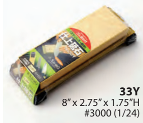
33Y 8" x 2.75" x 1.75"H #3000 (1/24)