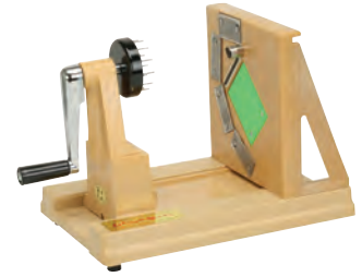
CKY-01 11" x 7.25" x 8"H (1/6)