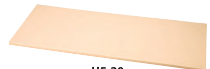
H5-20 750 x 330 x 20mm (1/5)