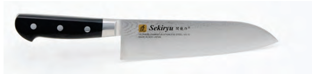
SR-VG100 11.75" (7") (1/24) Damascus Steel