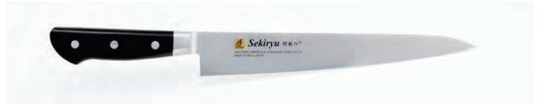
SR-VG400 14.5" (9.75") (1/24) Damascus Steel