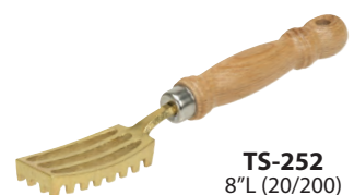
TS-252 8"L (20/200)