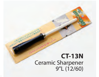
CT-13N Ceramic Sharpener 9"L (12/60)