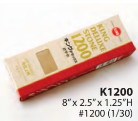
K1200 8" x 2.5" x 1.25"H #1200 (1/30)