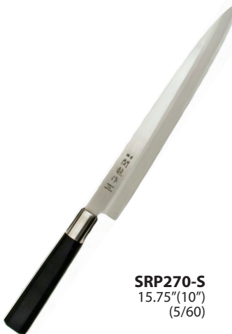
SRP270-S 15.75" (10") (5/60) Plastic Handle