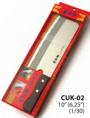
CUK-02 10" (6.25") (1/30)