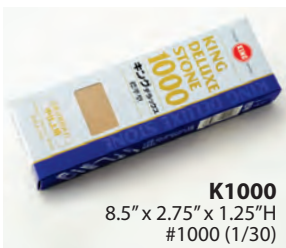
K1000 8.5" x 2.75" x 1.25"H #1000 (1/30)