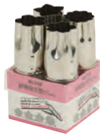
134 1"D x 1.75"H (12/144)