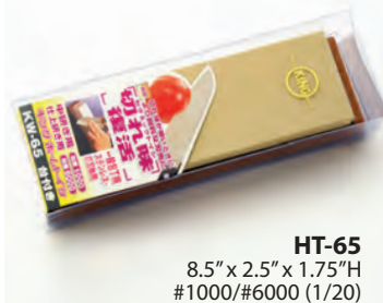
HT-65 8.5" x 2.5" x 1.75"H #1000/#6000 (1/20)