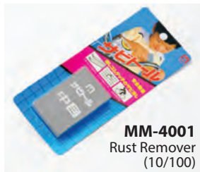
MM-4001 Rust Remover (10/100)