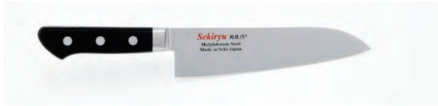
SR-MS180 11.75" (7") (1/24) Molybdenum Steel