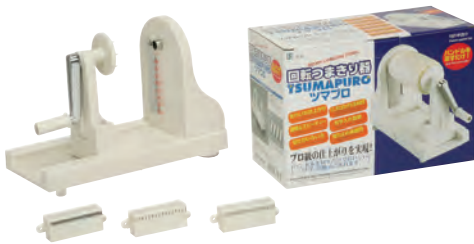
VS-801 9.5" x 4.25" x 6.5"H (1/12)