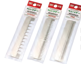
BR-1B-C Coarse Blade (10) BR-1B-M Medium Blade (10) BR-1B-F Fine Blade (10)