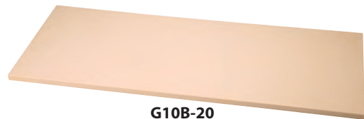
G10B-20 1000 x 400 x 20mm (1/2)