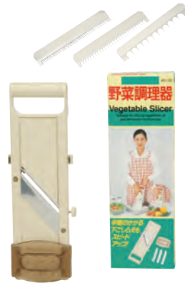
VS101 13" x 4.5" x 0.75"H (1/30)