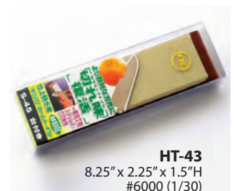
HT-43 8.25" x 2.25" x 1.5"H #6000 (1/30)