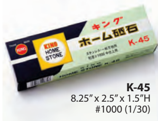
K-45 8.25" x 2.5" x 1.5"H #1000 (1/30)