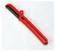
A-23 6.25" L (Assorted) (12/240)