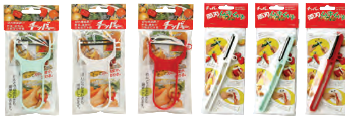
A-15 (Assorted) - 4.25"L (12/192)