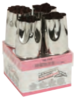
132 1.5"D x 2.25"H (12/144)