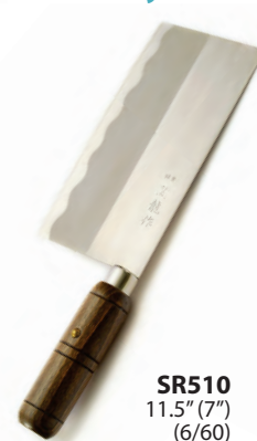
SR510 11.5" (7") (6/60)