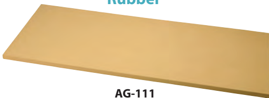
AG-111 1000x 400x 20mm (1/2)