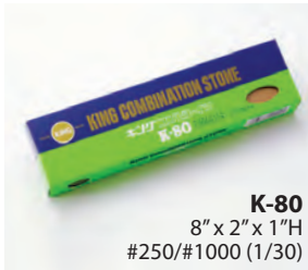
K-80 8" x 2" x 1"H #250/#1000 (1/30)