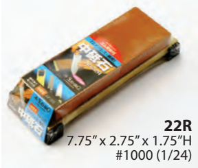
22R 7.75" x 2.75" x 1.75"H #1000 (1/24)