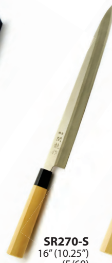
SR270-S 16" (10.25") (5/60)