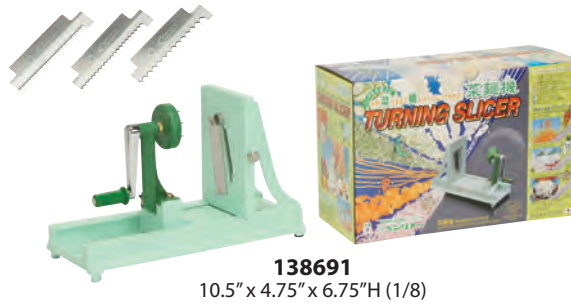
138691 10.5" x 4.75" x 6.75"H (1/8)