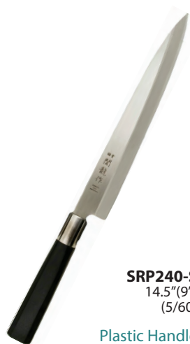
SRP240-S 14.5" (9") (5/60) Plastic Handle