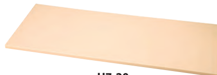
H7-20 840 x 390 x 20mm (1/5)