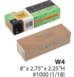
W4 8" x 2.75" x 2.25"H #1000 (1/18)